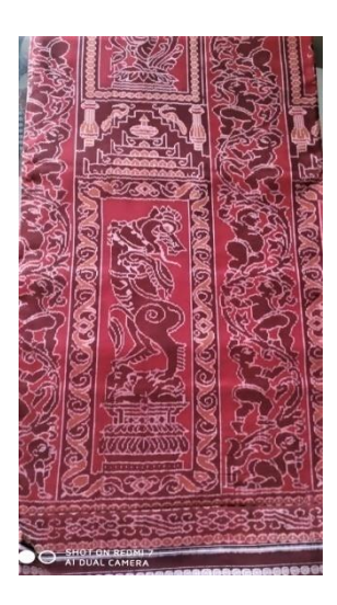
31. <u>Cotton Ikat Saree</u>

This cotton weft lkat Saree is the popular product of western Odisha. The design is made by lkat technique. The motif has been taken from temple architecture of Odisha. It took 15 days to produce the Saree.