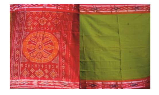
35. <u>IkatPhodaKumbha Saree</u>

This is a cotton weft IkatSaree. The body of the Saree is plain with small buti design and the palluis decorated with "Konark Wheel". The motif of anchal has been taken from famous sun temple situated at Konark. The border of the Saree is decorated with extra warp and warp lkatdesign. It took about 3 days to weave this Saree.