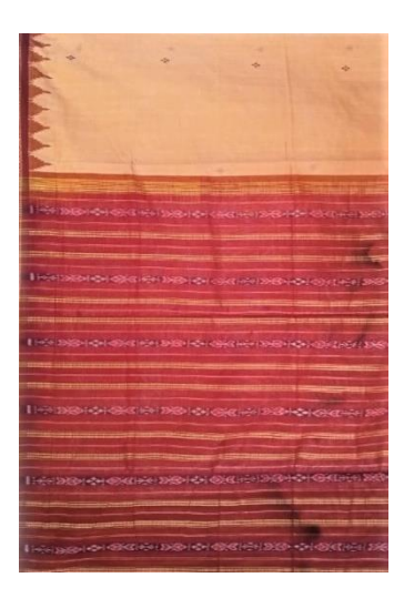
19. <u>Ikat Saree</u>

It is a cotton single weft Saree with temple motif in border and body is plain. Pallu is decorated with lkat (Tie & Dye) technique. It took about 5 days to complete the Saree. It is a medium range lkat cotton Saree.