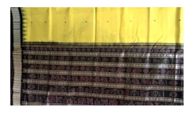
36. Cotton Gamsha

This silk Saree has 3 shuttle temple motifs which is popularly known as PhodaKumbha design in border. It is very tedious process. The palluof the Sareeis decorated with weft lkat and extra weft design. Border is decorated with extra warp using dobby. It took 10-12 days to weave the Saree.