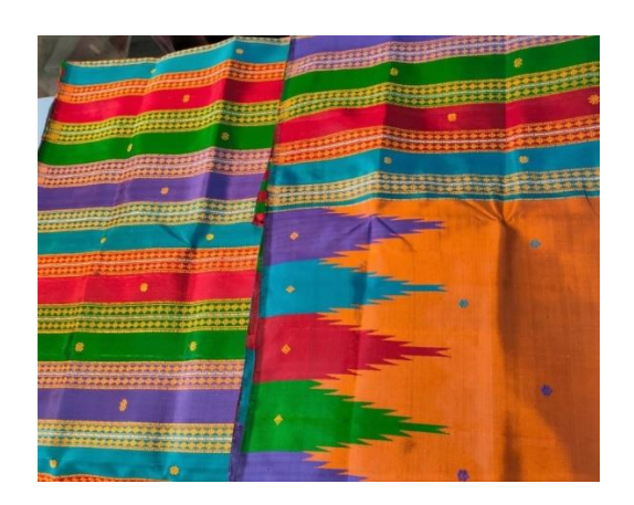
13. Berhampur Patta

Berhampur PhodaKhumbhaSaree are popular as BerhampuriPatta (Silk) and famous among the coastal parts of Odisha. The products are Saree, joda, dhoti, chaddar and stoles made up of pure silk, both in warp and weft. In the border, designs like temple known as kumbhand the pallu has designed in extra weft called "Salari"anchal.