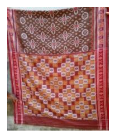
23. Jagatsinghpur Cotton Saree

It is a single lkat cotton Saree, both body and pallu are made with weft lkat and border is ornamented with warp lkat. Small dobby motifs are woven in border. It took about 7 days to weave. This type of medium range lkat Saree are widely produced in costal district of Odisha.