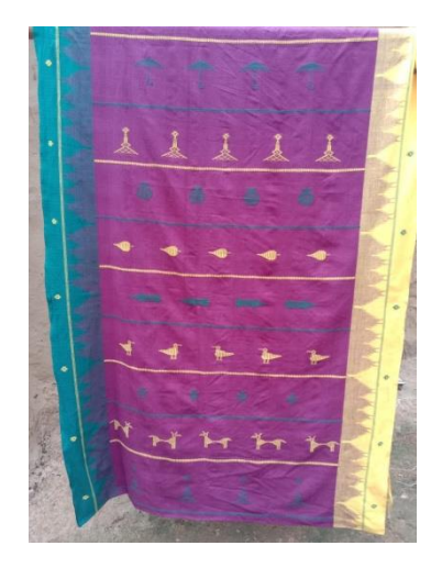
18. <u>Ikat Saree</u>

It is cotton Saree using three shuttle work in border. Extra weft designs are ornamented in body and pallu. The motifs used are traditional tribal design form local area of Nabarangpur. It took about 10 days to weave the Saree.