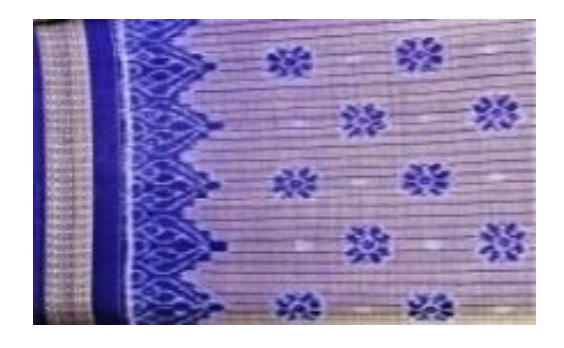
32. Cotton Ikat Saree

This is cotton weft IkatSaree which is traditional product of western Odisha. The border of the Saree is decorated with special type of temple design. The design of body is covered with flower motifs and border is decorated with extra warp using dobby. It took about 6 days to weave this Saree.