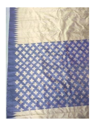
12. Berhampur Patta

Gopalpur is known for the production of different Tussar fabrics and Saree, using Ghichatussar, reeling tussar, silk, noil etc. This is a TussarSaree using weft Tie & Dye technique in border and pallu. Reeled tussar is used to produced the Saree. It took about 10 days to complete.