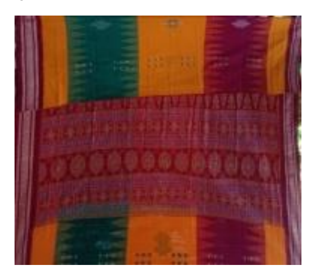
30. <u>Cotton IkatSaree</u>

This contemporybomkaiSaree is made up of cotton yarn. The body is a tri colour with temple design on each colour. The each colour portion also looks like a Saree itself. The border of the Saree is decorated with extra warp design using dobby. Ikat technique is combined with extra warp and weft design to ornament the Saree. It took 6 days to produce the Saree.