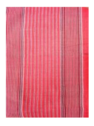
28. <u>Cotton IkatSaree</u>

Gamcha is commonly produced with cotton material. The specialty of this Gamcha is the colour used as contrast colour with stripe. There are very few weavers in Kandhamal district, producing such types of low range products, mainly Gamcha. A weaver can weave 4 to 5 Gamcha per day.