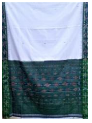
34. <u>Ikat Cotton Saree</u>

This is a cotton weftlkatSaree which is traditional product of Odisha. The body of the Saree is plain with small buti design and the palluis decorated with popular motifs of costal district of Odisha. This Saree is used in traditional festival of Odisha. It took about 3-4 days to weave this Saree.