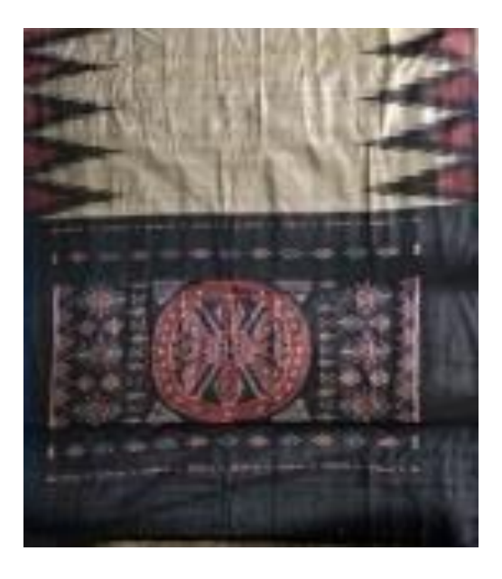
29. Cotton BomkaiSaree

This is a cotton single weft IkatSaree, which is traditional product of Odisha. The body of the Saree is plain with temple border. The pallu of the Saree is decorated with "Konark Wheel". The motif of anchal has been taken from famous sun temple situated at Konark. It took about 4 days to weave this Saree.