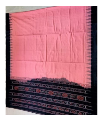
22. <u>Ikat Saree</u>

It is single weftlkat medium range cotton Saree. Border is decorated with temple motifs and pallu is made with weft lkat. Extra weft butis are in the body of the Saree. Solid colour effect is produced by dyeing the warp selectively i.e. for the pallu portion. It took about 4 days to weave.