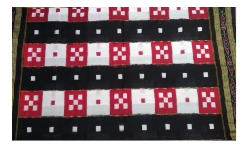
20. <u>Ikat Saree</u>

It is a double lkat cotton Saree. Popular "Sakta" motif of Sambalpur area is designed in Black & Red colour. Border and pallu is combination of extra warp and extra weft with single lkat design. It took about 12 days to complete the Saree.