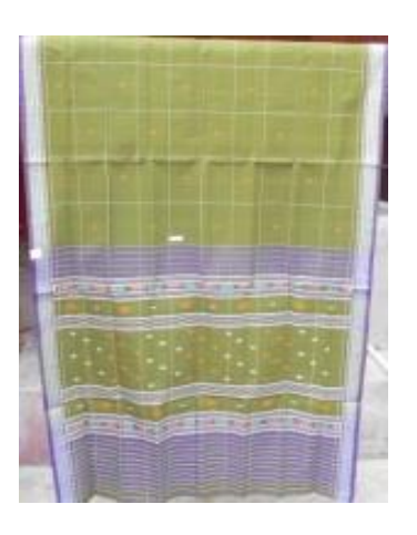
24. Cotton Dhoti

It is a cotton Saree popularly known as JagatsinghpurSaree. It is very comfortable to wear in summer due to its construction. Extra warp with dobby and extra weft in pallu are designed. It took about 3 days to complete the Saree.