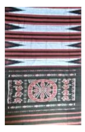
33. Cotton IkatSaree

This is cotton weft Ikat Saree, the pallu is decorated with "Konark Wheel" and conch. The motif of pallu has been taken from famous sun temple situated at Konark. The border of the Saree is decorated with temple design. The size of the temple is large and it covers towards middle. It took about 4 days to weave this Saree.