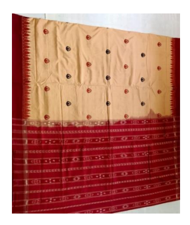
21. <u>Ikat Saree</u>

It is single weftlkat medium range cotton Saree. Border is decorated with temple motifs and pallu is made with weft ikat. Extra weft butis are in the body of the Saree. Solid colour effect is produced by dyeing the warp selectively i.e. for the pallu portion. It took about 4 days to weave.