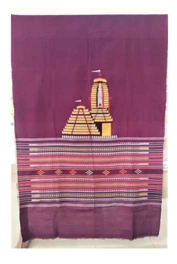
16. Ikat Saree

The items manufactured in Dhalapathar are mainly parda (door curtain), wall hanging, table cover etc. Dhalapatharparda, having unique design and beauty has got places in the doors of many handloom, art and craft loving people of Odisha. The parda is woven with thick threads by using a special weaving technique with the help of chiaries and cotton handmade heald shafts. The wall hangings are woven with same construction as door curtains in different sizes with different cultural designs. It is a cotton parda and took about 7 days to complete.